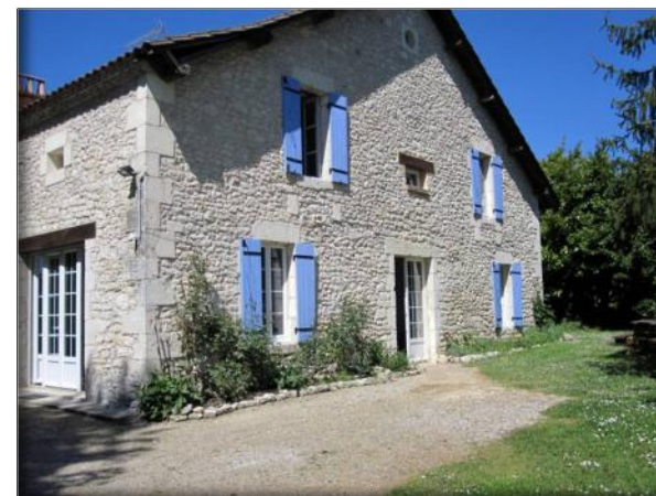
La Métairie *** Large house over 200 M 2