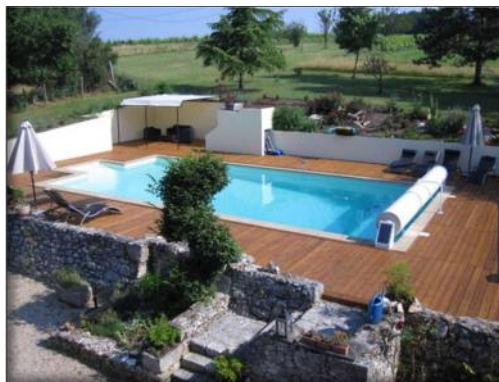
Swimming pool (12x6m)