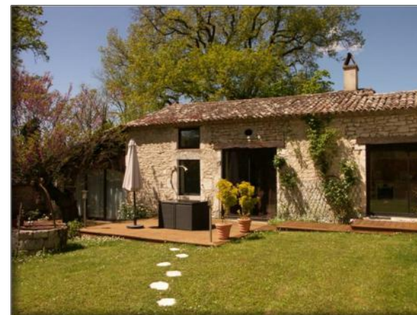
L'Armandine **** Beautiful apartment of 75 M 2