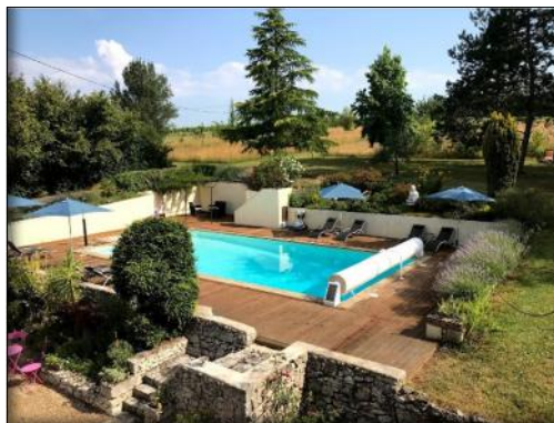
Swimming pool (12x6m)