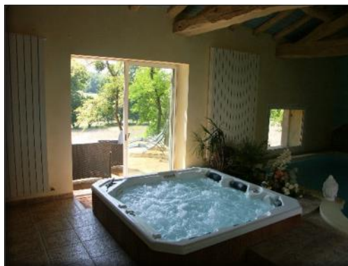
Jacuzzi & Hammam